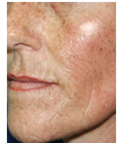
4 Weeks Post 2 Treatments